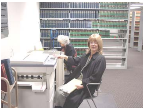
Copier in Law Library

Suggestions: Some type of notice might be provided so that persons with disabilities can alert court personnel to re-assign cases from one courtroom to another if better access is needed for a person with a disability who will be participating in a court proceeding.