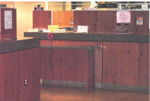
Braille signs appeared throughout the building.