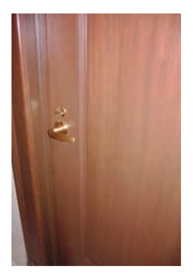
Suggestion: Replace latches with more accessible handles and adjust tension.